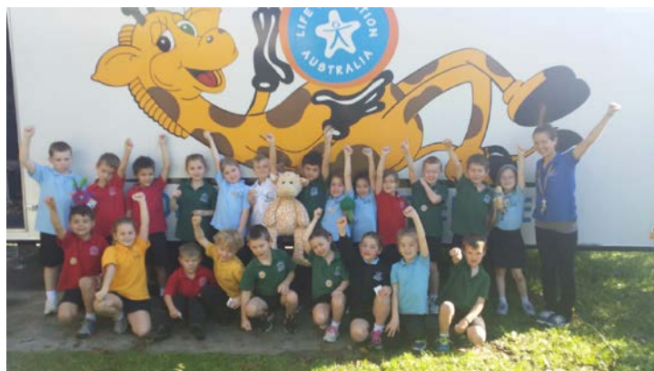
1L students at the Life Education van

Life Education exists to educate and protect our children from the dangers of drugs, it is an excellent program. We teach children to respect their bodies and to make informed choices. Our approach is based on the concept that each child is special and individual. Life Education educators are trained to work in partnership with schools and their surrounding community. All Life Education programs are linked to the school curriculum and ensure children learn about their own bodies and how drugs can cause harm to their body. Each program is directed at the students level of development. With the help of their iconic mascot, Healthy Harold, they aim to encourage students to live safe and healthy lives.