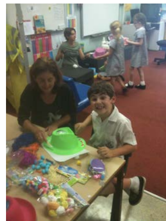
Easter Hat making in 2F