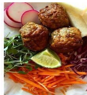
Meatball Salad Box