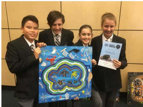
Year 6 Leadership Team