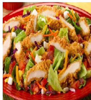
Chicken Tender Salad Box

Salad box with mixed beans (vegetarian).