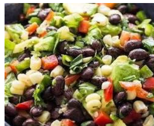
Mixed Bean Salad Box

If you would like a copy of the menu please collect one from the canteen.